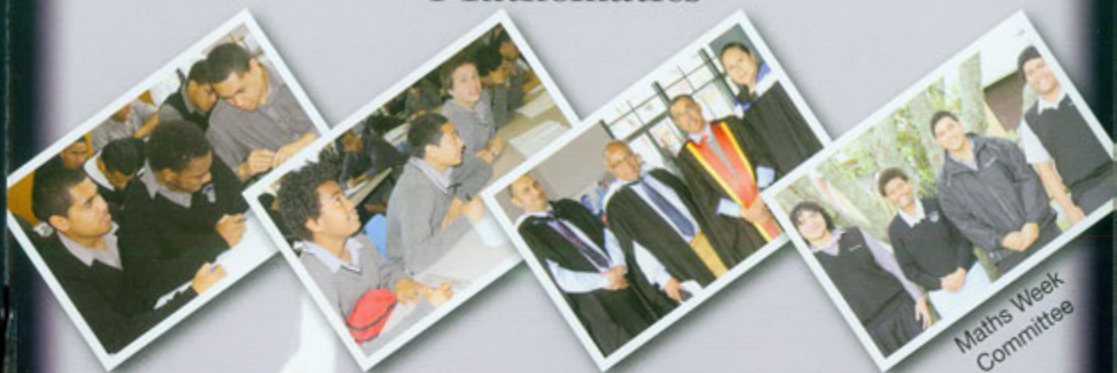
Maths Week Committee

Our journey on our vaa's have carried us this far for the year. We farewell our senior students at the end of Week 3 as they begin NCEA examinations and we farewell our Year 13 students as they begin to prepare a life after Wesley College.